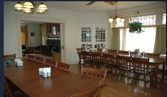
The Gate House for Women