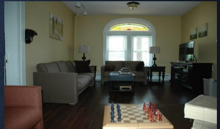
The Gate House for Men