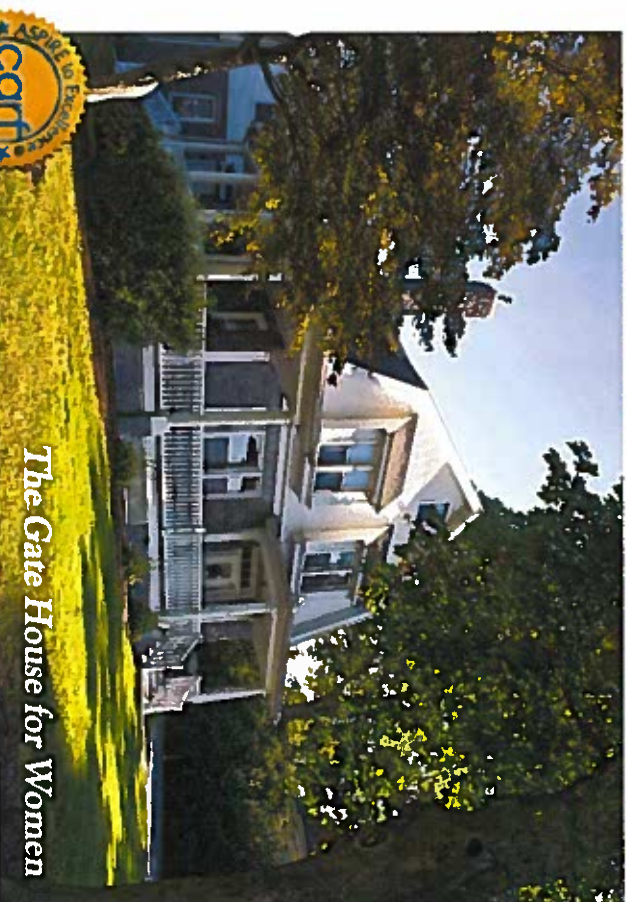
The Gate House for Women